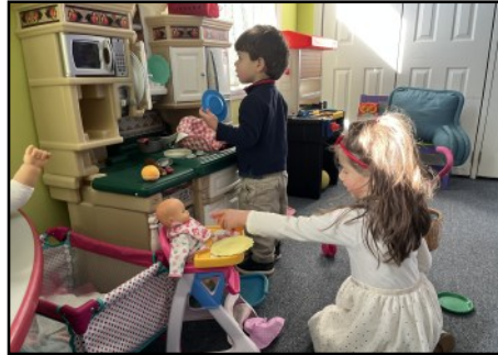
Children in the nursery room.

I invite you all to share in this rewarding experience interacting with the children of the members in our congregation. We are looking for volunteers to assist in the childcare room with me; we'd have a list and rotate through the names. It would be a once a month volunteer opportunity. You can follow along by listening to Pastor