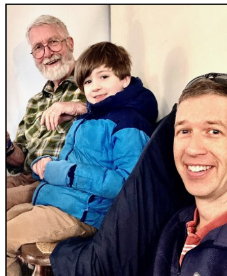
Our Tech Team.