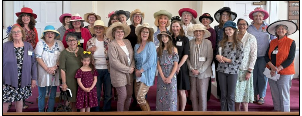
Mother's Day 5/11/25. Below is the list of donations received for blankets!

ledyardcongregational.org and click on the Chatter drop down box.